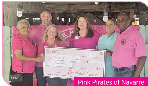
Pink Pirates of Navarre