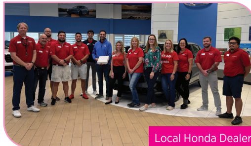
Local Honda Dealer