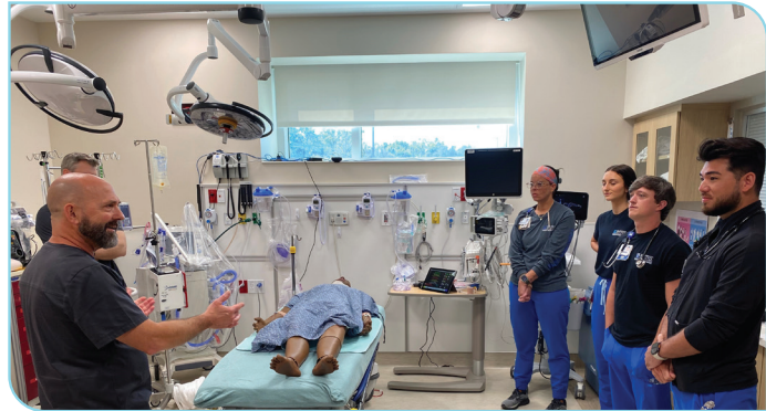
Trauma Simulation Training