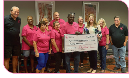
Pink Pirates of Navarre