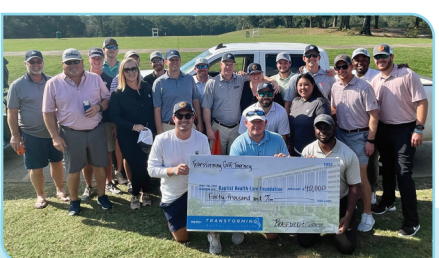
Brasfield & Gorrie General Contractors