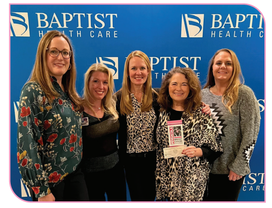
Pensacola Breast Cancer Association

To find out if you qualify and to schedule a mammogram, contact Baptist Patient Access Support Services at 850.908.7500, ext. 1 .