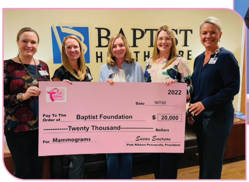
Pink Ribbon Pensacola